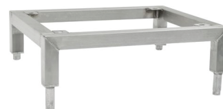
Locker Stands - Add one per locker